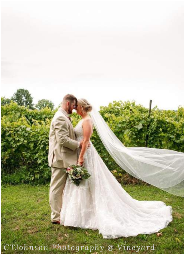
CTJohnson Photography @ Vineyard