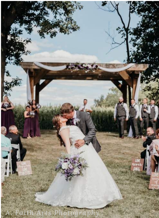
A. Faith Arts Photography