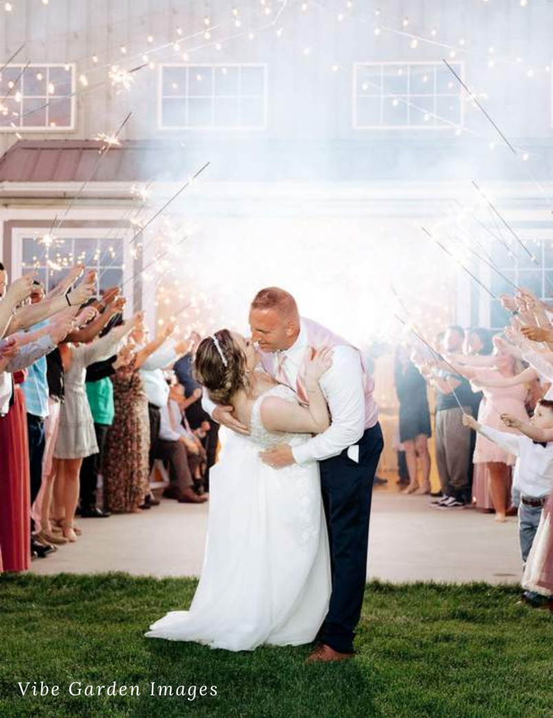
Vibe Garden Images