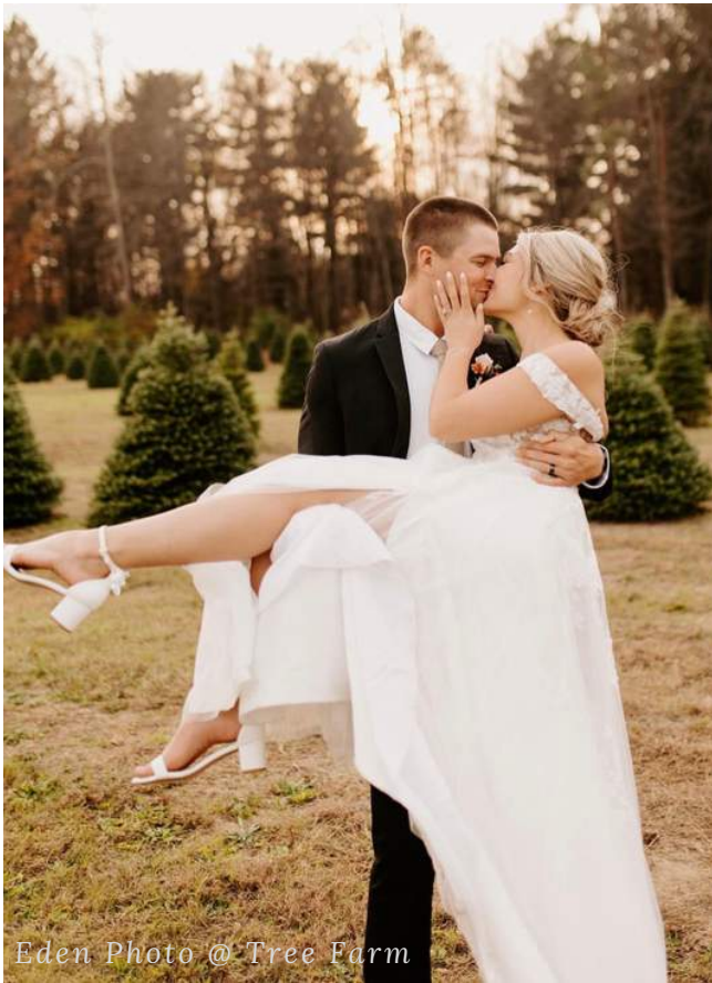
Eden Photo @ Tree Farm