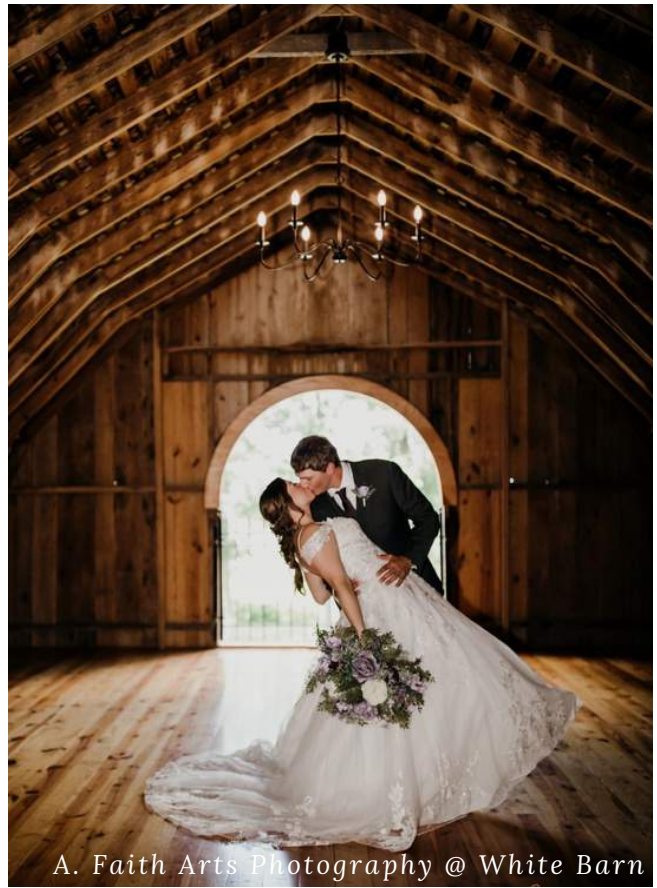
A. Faith Arts Photography @ White Barn