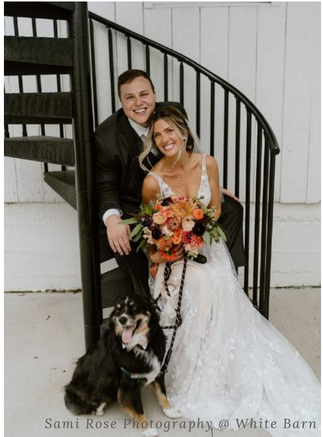
Sami Rose Photography @ White Barn