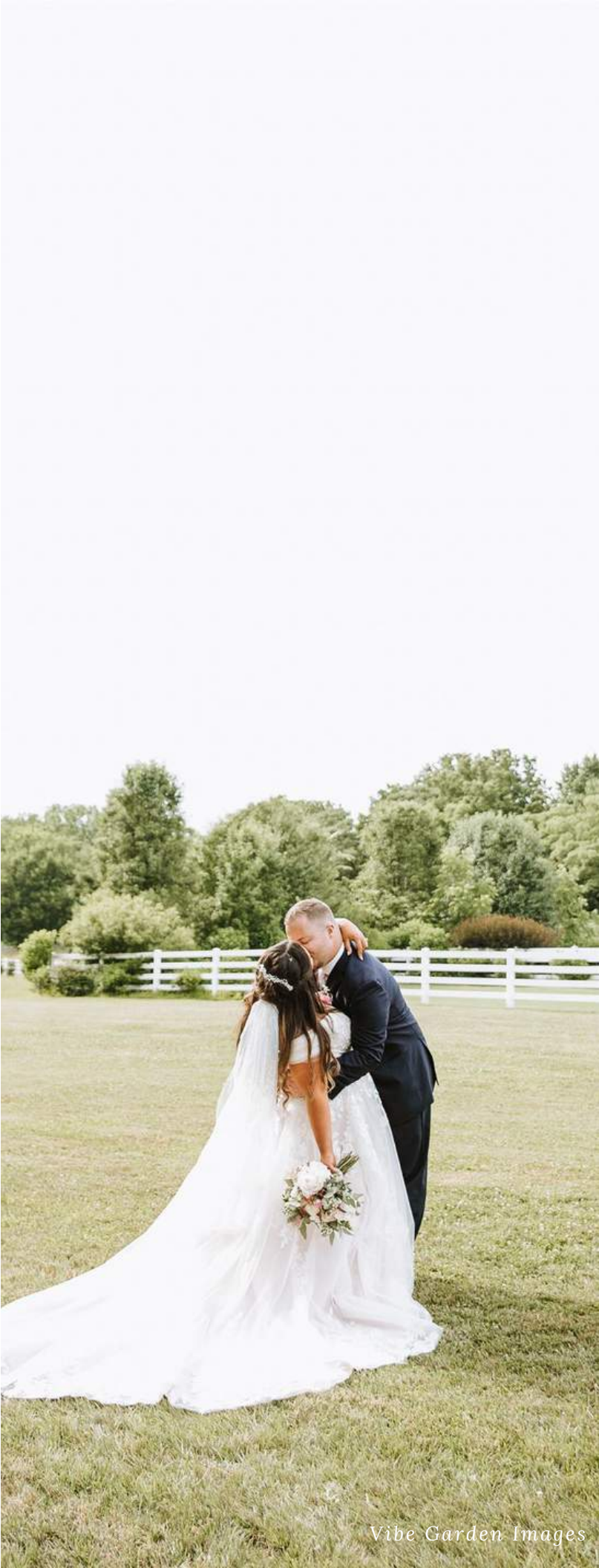
Vibe Garden Images