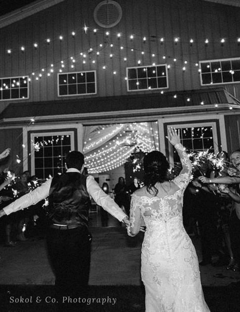
Sokol & Co. Photography